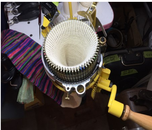
Fig. 1. Erlbacher Gearhart Sock machine knitting tubes of commercial yarn with a 64 slot cylinder.

In 2014, I discovered that Sock Knitting Machines were really fast at making socks. A lot faster than handknitting – proficient CSM knitters could make a pair of socks in 2 hours. That contrasted with my handknit sock rate of three weeks per pair. I also discovered CSMs were really picky about what yarn was cranked thru them. I stuck with commercial sock yarn after a few attempts with my handspun yarn.