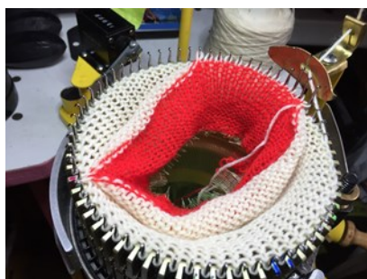
Fig. 8. Thirty rows of stockinette tube being hooked over the last row knitted to form a knitted-in hem top on the CSM. Orange waste yarn.

The CSM can easily create a stockinette hemmed top on the machine, even when knitting the heel on the machine might be too difficult.