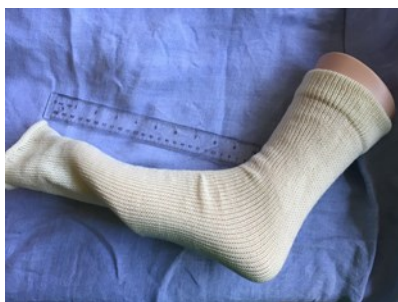
Fig. 10. The knitted-in hem top being test for fit at leg top and in-step. NOTE: Hem tops are very desirable for wearers who need a 'soft top'. Most commercial socks are too tight at the top for many people. A big benefit for the custom CSM sock.