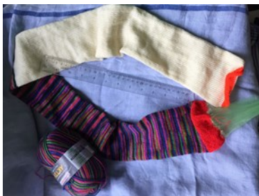
Fig. 6. Tube off machine with the orange waste yarn in place at each end.

Fig. 1 (see page 4) shows the simplest method of cranking: a single sock tube that will be divided at the middle and afterthought knitted to finish the pair.