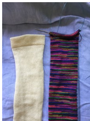
Fig. 11. Comparison of single tube of a pair of socks and one hem top sock blank.

Submitted by Lois Swales. If you would like to be a sock tube guinea pig, you can contact me to see what happens when your yarn runs thru my CSM.