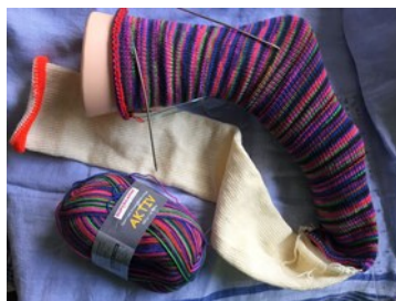
Fig. 7. Circular needle (magic loop) inserted in sock top to knit ribbing. Sock tested on foot for checking fit at instep and leg top. Heel will be afterthought and then toe finished to length by hand.