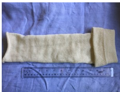
Fig. 9. Finished knitted-in hem top on a single sock length tube. Orange waste yarn removed. Only the afterthought heel and toe need to be hand knitted. Two of these hem tops will make a pair of socks, of course.